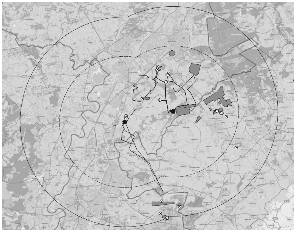
Figure 1. Overview of all certain (solid lines) and probable (dotted line) flying routes and foraging areas (polygons and dots) used by the seven tracked female Geoffroy's bats. The two houses represent the two colonies. The dotted circle has a radius of 5 kilometres, the solid circle a radius of 8 kilometres.

although they occasionally crossed tens of metres of open fields as well as two-lane roads close to the colonies. One of these roads (the N274), was crossed at multiple locations along a 3 km portion of the road that passed through a woodland, while the second road (the N572) was crossed where isolated tree rows intersected the road. The animals crossed at canopy-height. The animals spent large part of the night flying in several hunting areas, located in forests and stables. When returning to the roost in the morning, they often briefly visited stables en route again. The animals did not venture farther than 8 kilometres from their maternity roost (figure 1); three of the bats regularly foraged in Germany.